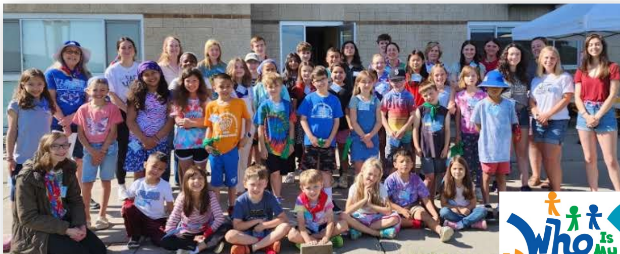
Vacation Bible Camp 2023